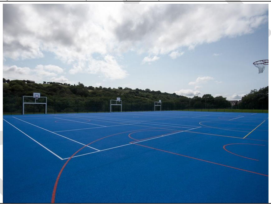
Example of MUGA servicing Tonyrefail Community School.