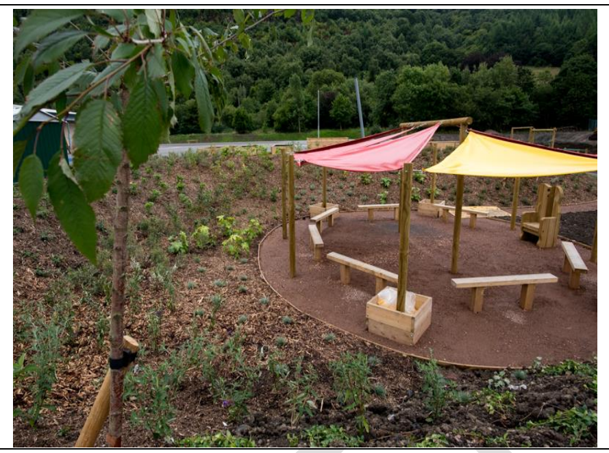
Example of outdoor learning area at Cwmaman Primary School.

There will be on-site provision for staff parking as well as an on-site dedicated drop-off area for the home to school transport vehicles.