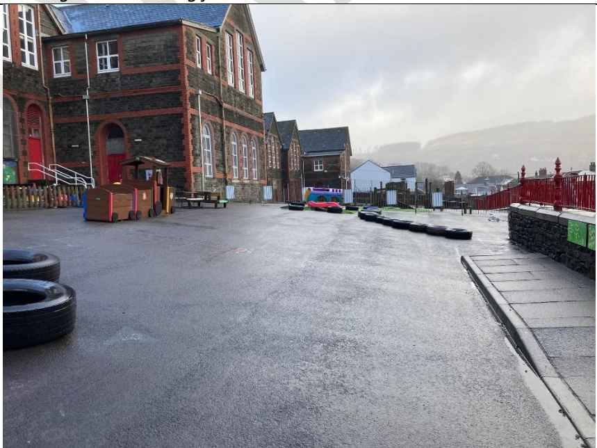
The view of the tarmac yard servicing the infant block.