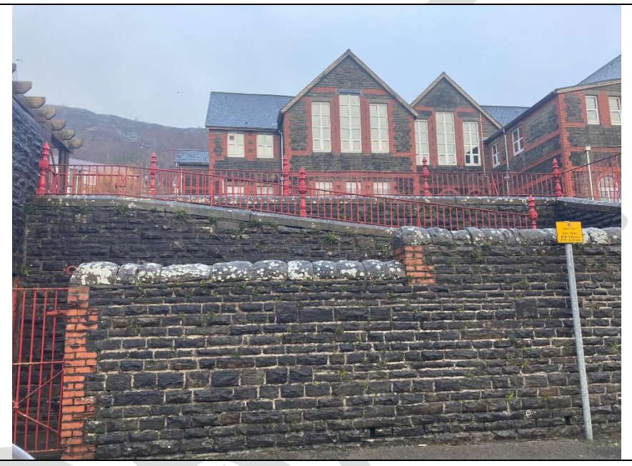
The view of the existing school building from Darran Terrace.

YGG Llyn y Forwyn is a Welsh medium community school located at Darran Terrace, Ferndale. The school site consists of a traditional stone Victorian School building. According to the condition survey of the school carried out by the Council in 2019, YGG Llyn y Forwyn is graded D for condition and C for suitability, where A is the highest and D is the lowest performing building respectively. It is acknowledged that this is the worst school in the Council's education portfolio in terms of condition and suitability.