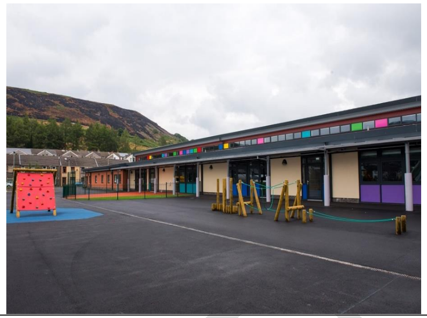
External view of Cwmaman Primary School opened by The Council in 2018.