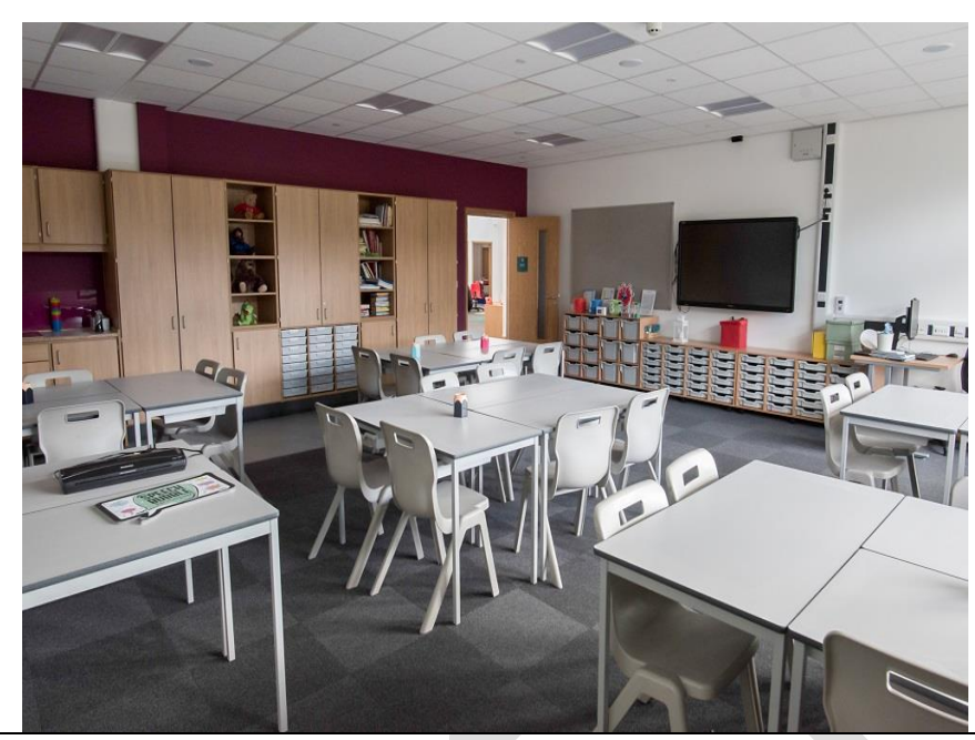
Typical junior classroom in a 21st Century School delivered by the Council.